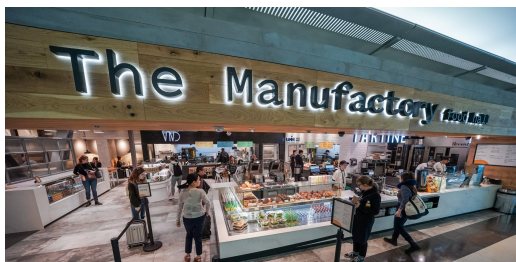
The Manufactory Food Hall

There's no denying that travelers are buzzing about San Francisco International Airport's Manufactory Food Hall , and they love the bar tucked away inside it just as much. After sampling food from renowned San Francisco chefs, round out your visit by pulling up a stool at the bar for a craft cocktail or two. The drink list is vast and impressive, but if you're looking to keep things simple, you can't go wrong with an SF Old Fashioned made with Elijah Craig.